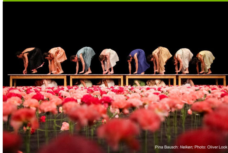
Pina Bausch: Nelken