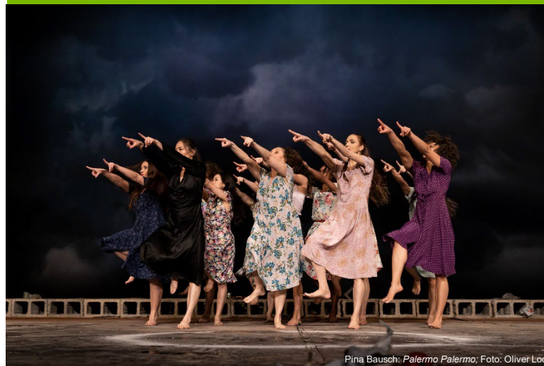
Pina Bausch: Palermo Palermo